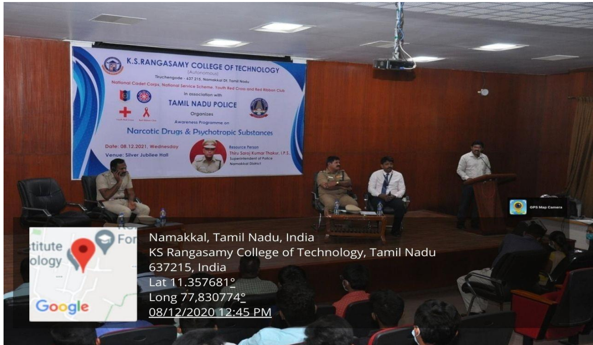
Chief Guest address to the student community while educating on psychotropic substances