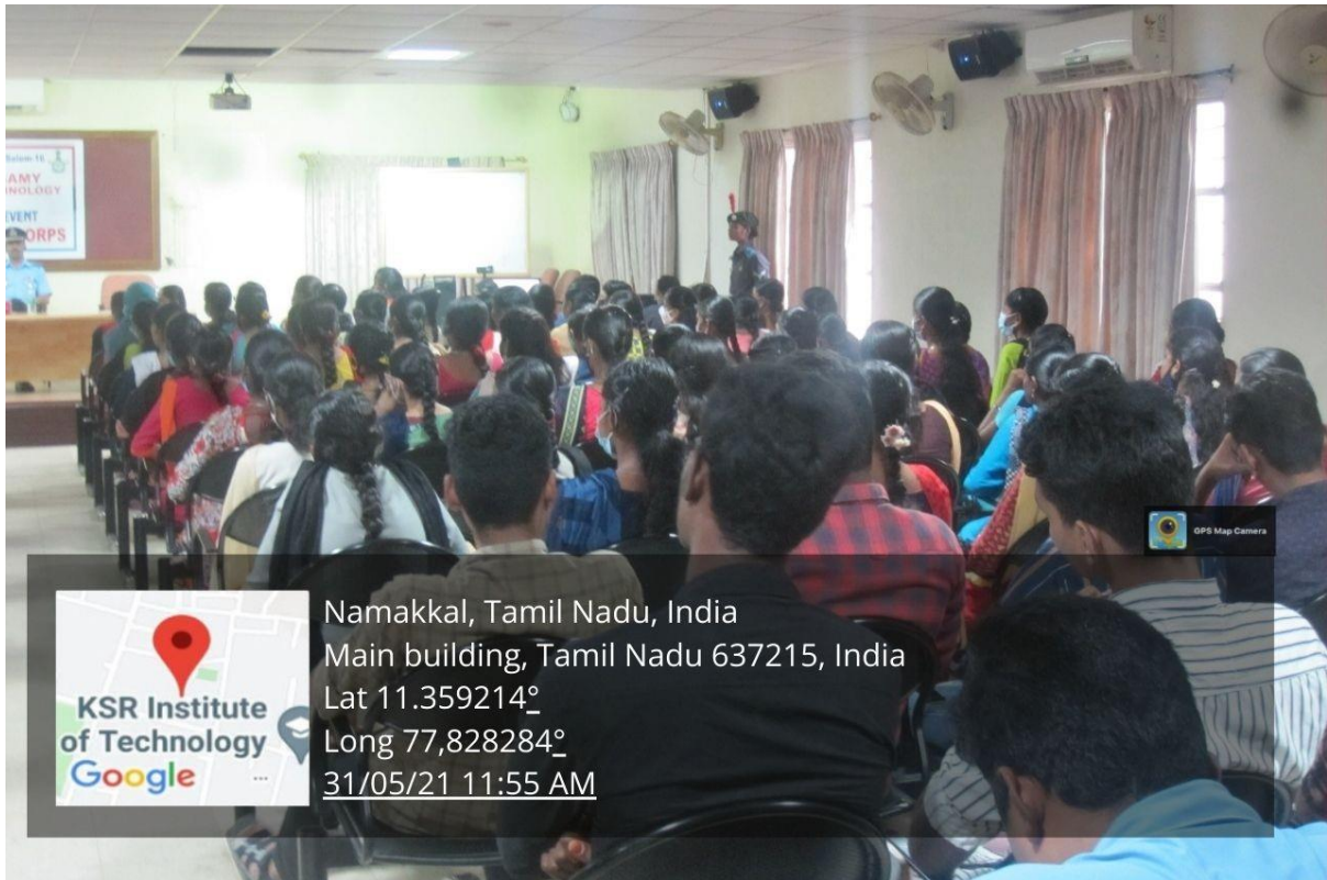
Glimpses of the tobacco awareness program