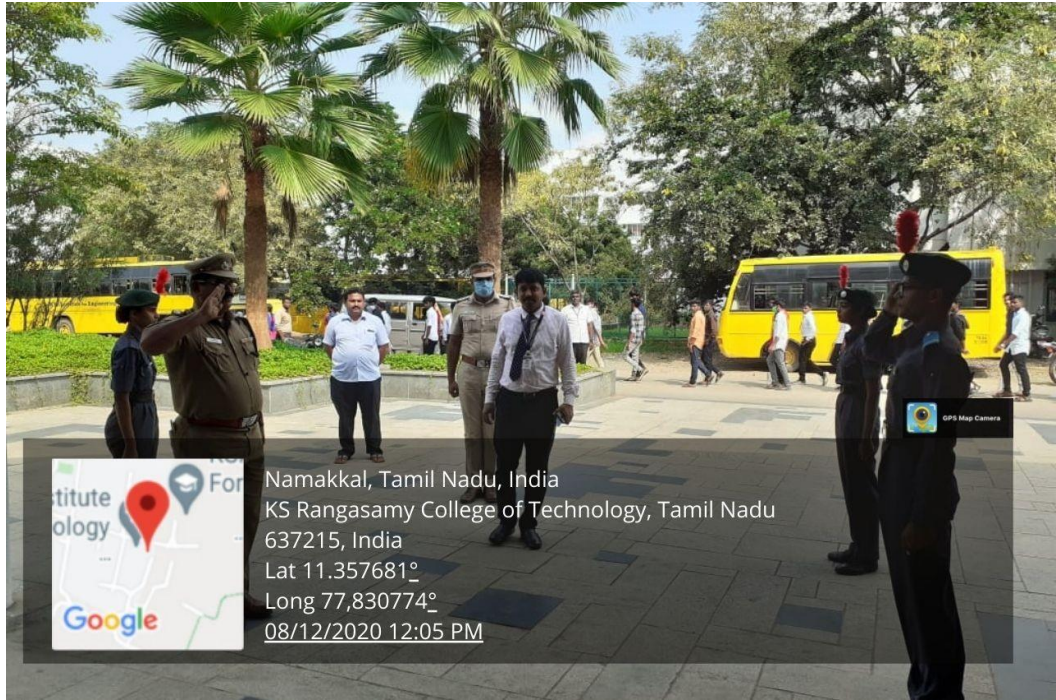
Interaction with the discipline committee team